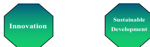
Fig: 1 Elements of Entrepreneurship (Source: Compiled by Researcher)

Both terms Innovation and sustainable development are major elements in modern entrepreneurship, as they address the need for businesses to adapt for societal expectations and environmental challenges. But when they both integrate with each other, the entrepreneurship will be successful. Here's a breakdown of these concepts and their importance in entrepreneurship.