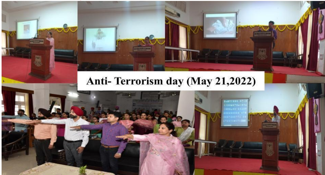
Anti- Terrorism day (May 21,2022)