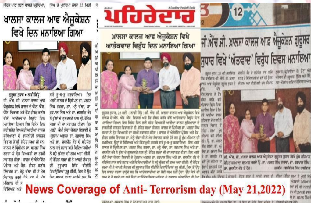
News Coverage of Anti- Terrorism day (May 21,2022)