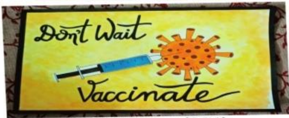
Pooja Verma (201)