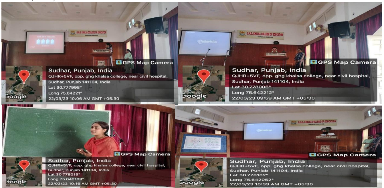
Cultural programme was organised on the visit of Alumni members (session 1995-96) GHG Khalsa College of Education Gurusar Sudhar

Morning assembly to celebrated days as International Mathematics day, World Water day and Martyrs day (March 22, 2023)